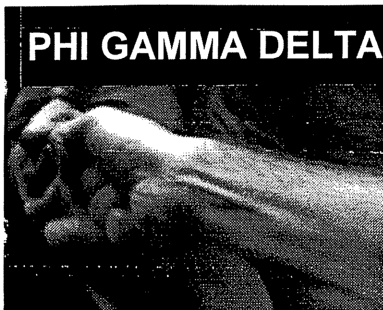
A picture from January Initiation ... just kidding